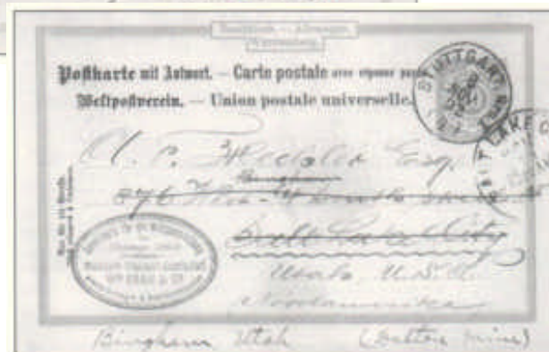
A Würtemberg UPU postcard with attached reply card (Mi. P29/I) sent from Stuttgart on 8 Nov 1892 to Anton in Salt Lake City and redirected to Bingham, Utah.